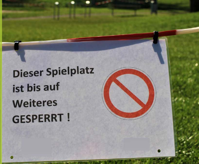
Playground closed until further notice due to COVID 19.