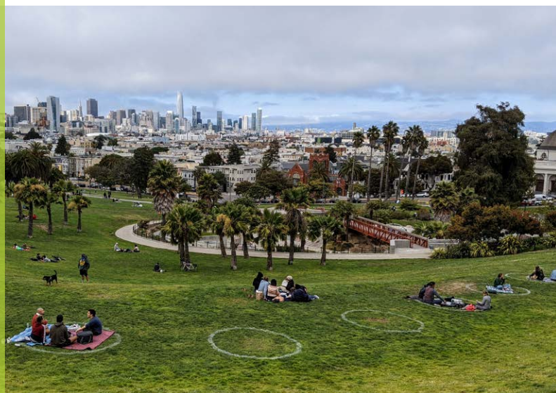
Social distancing circles in Dolores Park, San Francisco.

The physical availability of green and blue infrastructure was of particular concern during the pandemic. During lockdowns, the distances that could be travelled were restricted and public transport was reduced, meaning that people could only access green spaces if it was close to home. Their amenities and features also became important. For example, in Oslo, inhabitants sought out the greenest public spaces with most tree coverage to tackle COVID-19 mobility restrictions 4 .