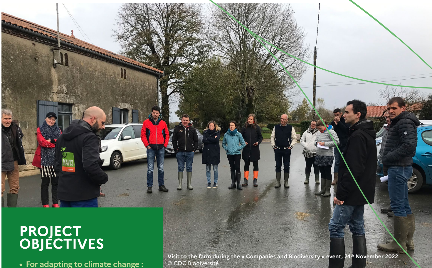
Visit to the farm during the « Companies and Biodiversity » event, 24 th November 2022