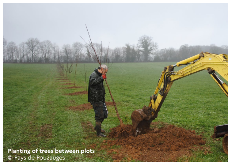
Planting of trees between plots