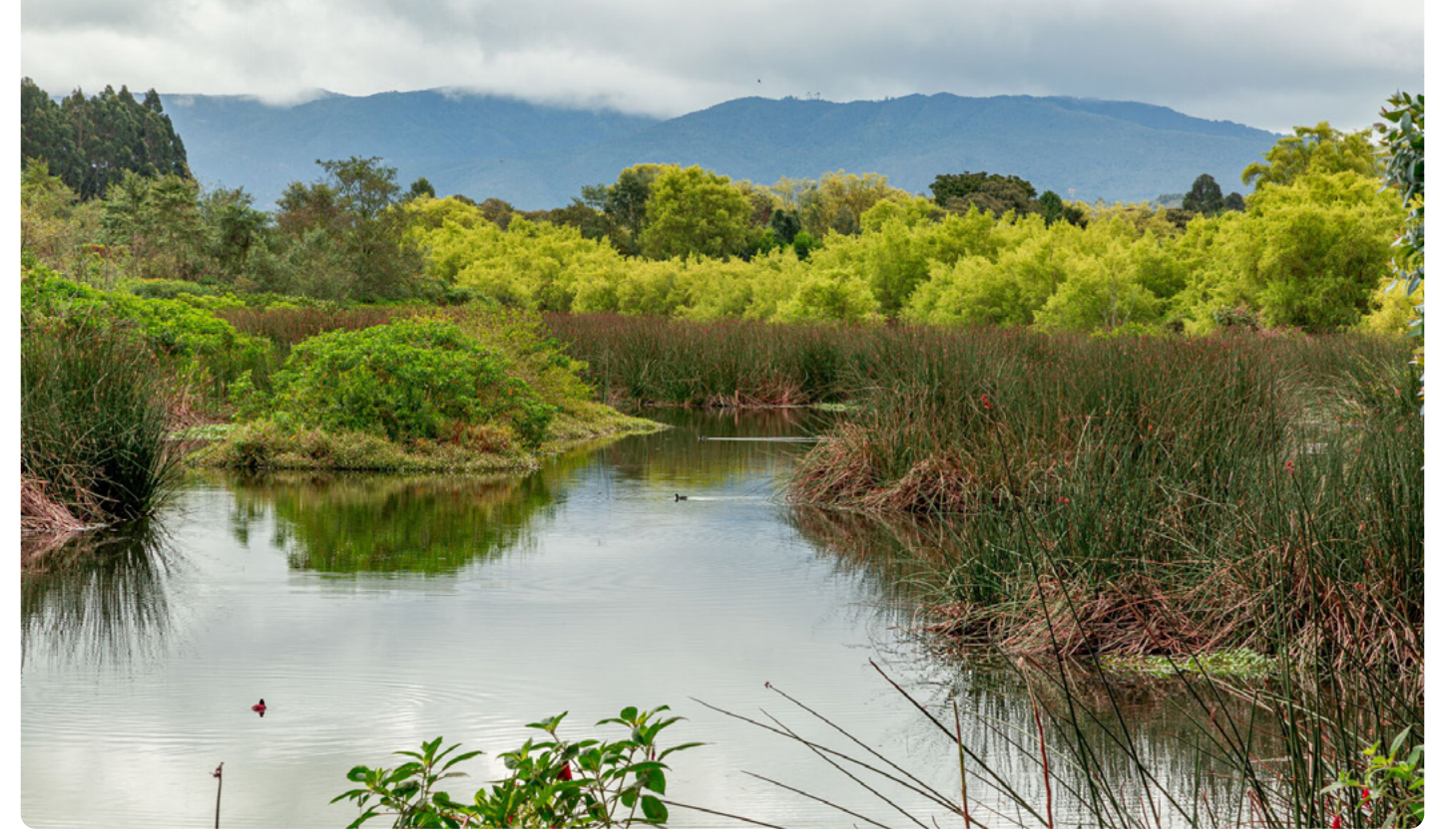
La Conejera wetland.