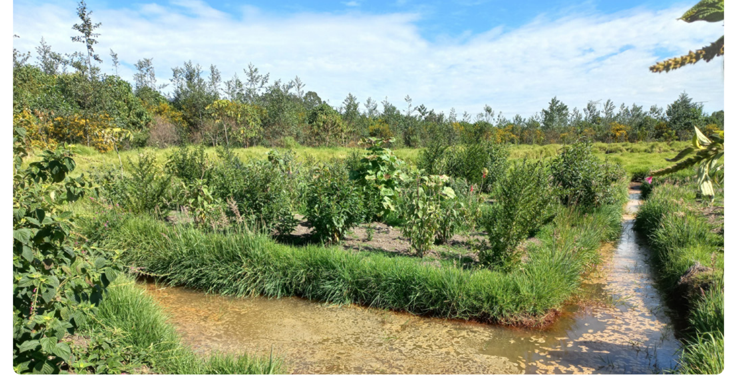
Camellones Muiscas, Northern edge of Bogotá. Diana Ruiz

Although these mechanisms have allowed progress in the management of Bogotá's wetlands, there are still important socioenvironmental conflicts that affect their functionality due to formal and informal urbanisation processes, contamination, and negative perception of wetlands. It is therefore essential to strengthen comprehensive strategies that include the participation of different actors and sectors of society. One of these strategies is the Wetlands Roundtable, a participatory board in which the different interventions carried out by the mayor's office within the framework of District Wetlands Policy are discussed with community, social organisations and district organisations. Another important strategy is the generation of knowledge, advice and support for bird watching and nature tourism initiatives in wetlands that allow the community to access the benefits of urban nature while advancing conservation objectives. The monitoring of actions derived from the aforementioned programs and instruments is a key tool for the continuity of these programs and to promote the active participation of different urban stakeholders in the conservation and management of these ecosystems.